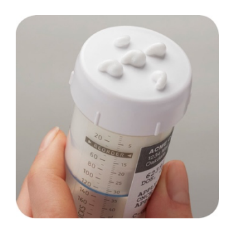
3. Confirm that cream has exited the holes of the applicator cap.