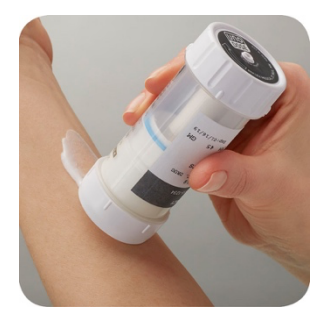
4. Apply the cream to the skin absorption site as listed on your prescription label. May Rub applicator or apply as directed per physician or pharmacist. Rotate areas with each application.