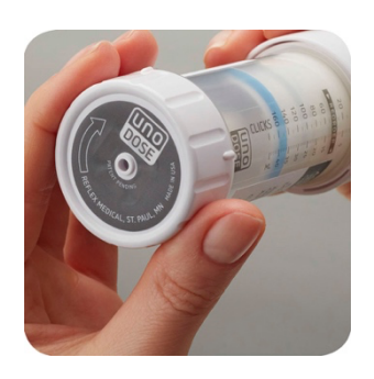
2. Turn the dosing knob in the direction marked for the number of prescribed clicks.