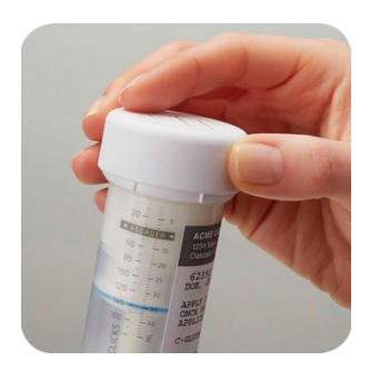
1. Remove the protective cover with a light counterclockwise twist and pull while holding the barrel.