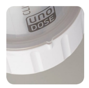
5. Replace the protective cover with a light push and clockwise turn. You will hear and feel a click.

Be sure to leave the knob in a "lock" position, and not between click positions.