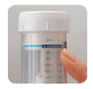
Check the scale at the blue line for the number of clicks remaining.

Be sure to leave the knob in a "lock" position, and not between click positions.